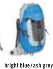
bright blue/ash grey