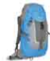
bright blue/warm grey